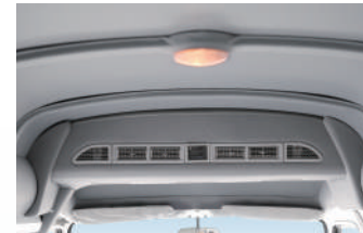
Air-Conditioning Vents On Both Sides Making Cooling In Travelling