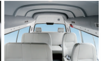
14 Seats (2+3+3+3+3) Layout