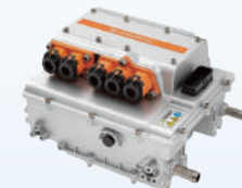
Independent Drive Motor Controller