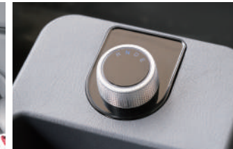
DRIVE & ECO Driving Modes Meeting Different Road Condition